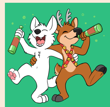
Artist: Paco Panda

Pikkujoulu, which translates to "little Christmas", is a Finnish pre-Christmas party tradition usually celebrated late November or early December. A typical pikkujoulu party will include seasonal food, singing, a generous amount of alcohol, and perhaps police intervention if things get too rowdy (which is not uncommon).